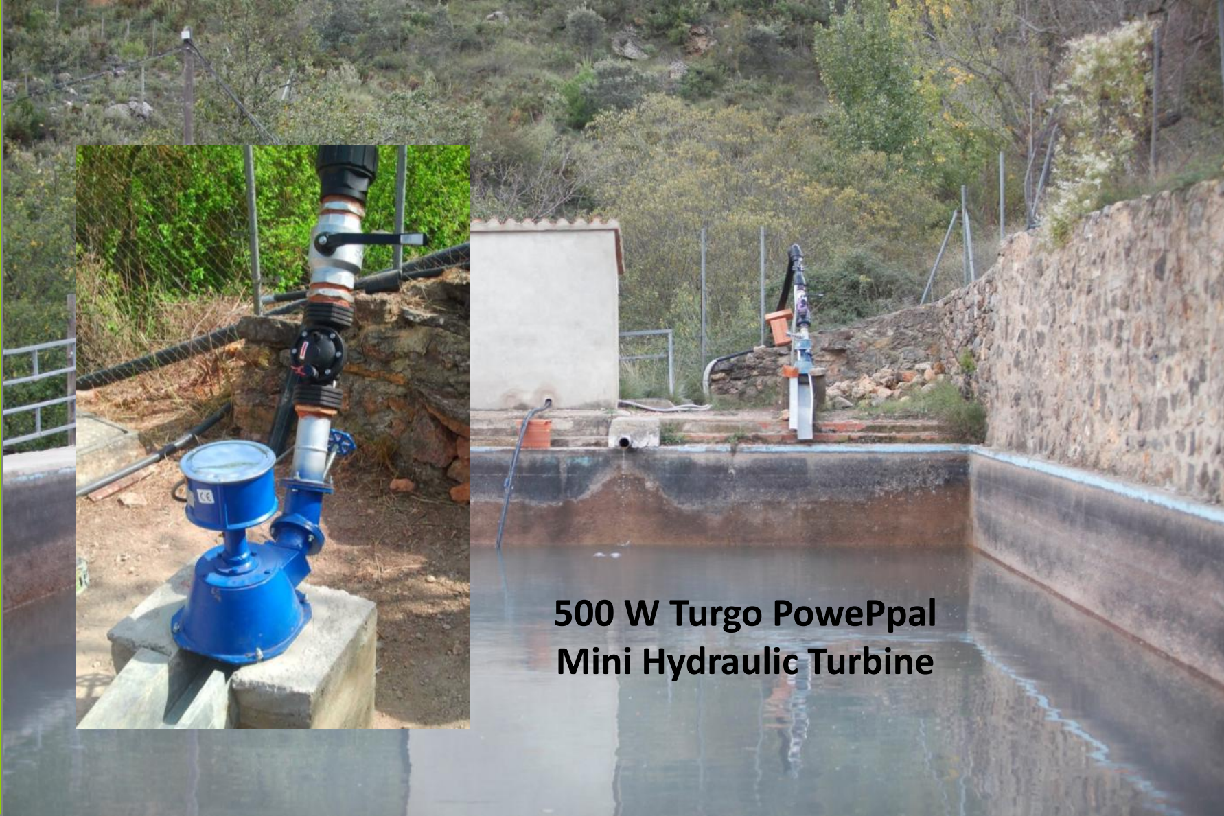
500 W Turgo PowerPal Mini Hydraulic Turbine