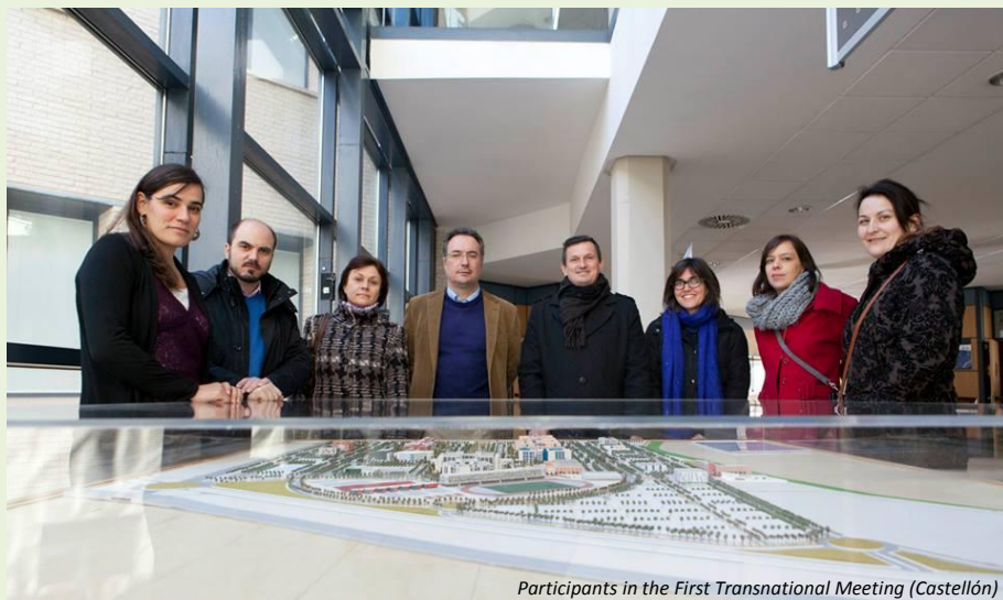
Participants in the First Transnational Meeting (Castellón)

The direct beneficiaries of the project are the university students involved in degrees related to renewable energies and rural development. Efforts will be done to attract students coming from rural areas. Concerning the staff, three target groups have been identified: professors, technicians and administration personnel in both universities and SMEs. Furthermore, the project will count with the participation of relevant stakeholders, such as vocational education centres, local governments and social enterprises.